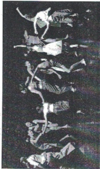
SEE LIGHT PAGE A16 The Saint Joseph Ballet will perform tonight at The Barclay.

"It's just kind of astounding to see so many people on stage move together to create something beautiful together," she said.